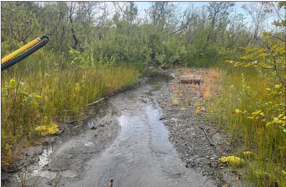
Figure 3.—Looking downstream at waypoint 1045.