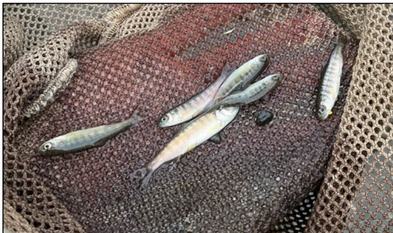
Figure 1.–Juvenile coho salmon caught at waypoint 1045.