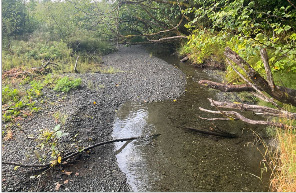
Figure 2.—Ditch upstream at waypoint 1044.